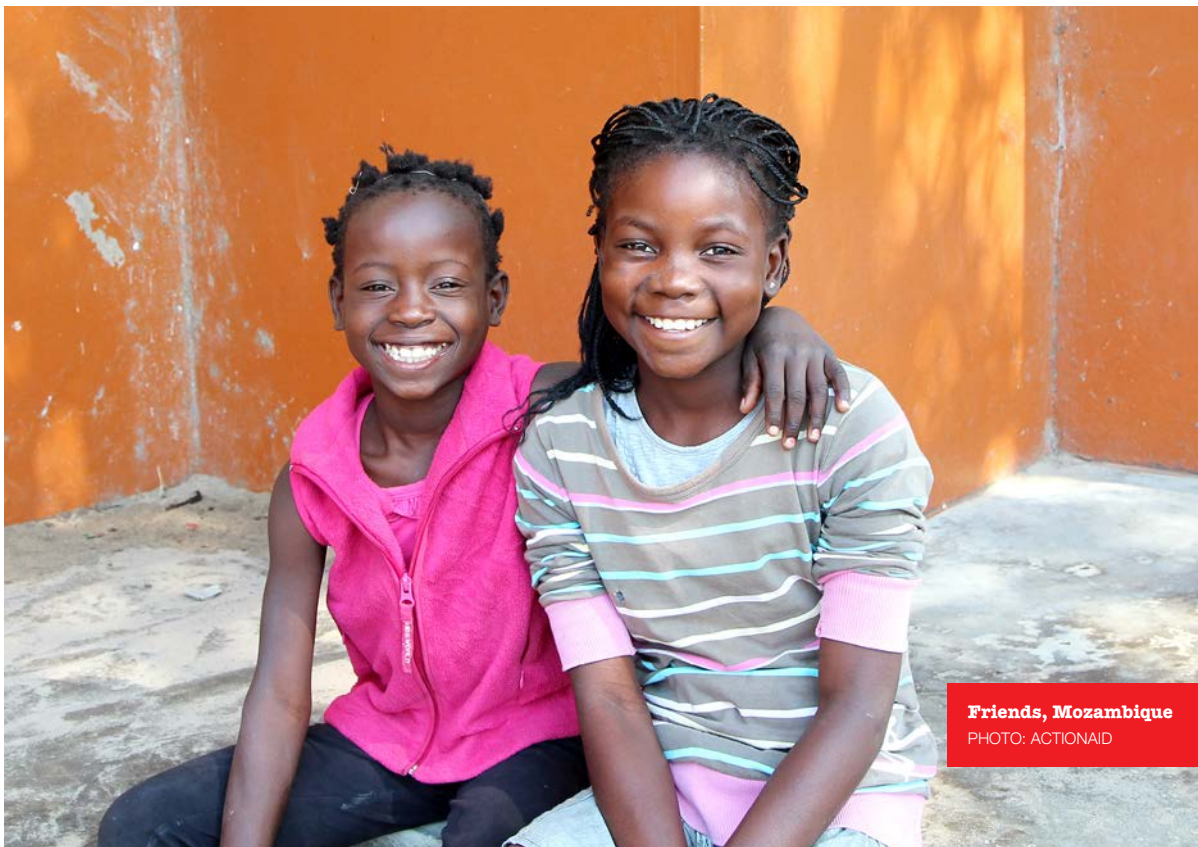
Friends, Mozambique

Underlying all these issues is a lack of adequate financing.