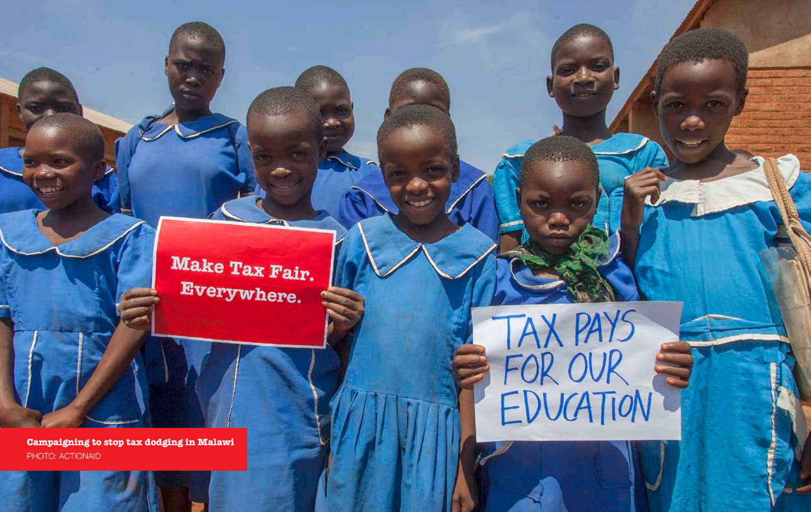
Campaigning to stop tax dodging in Malawi