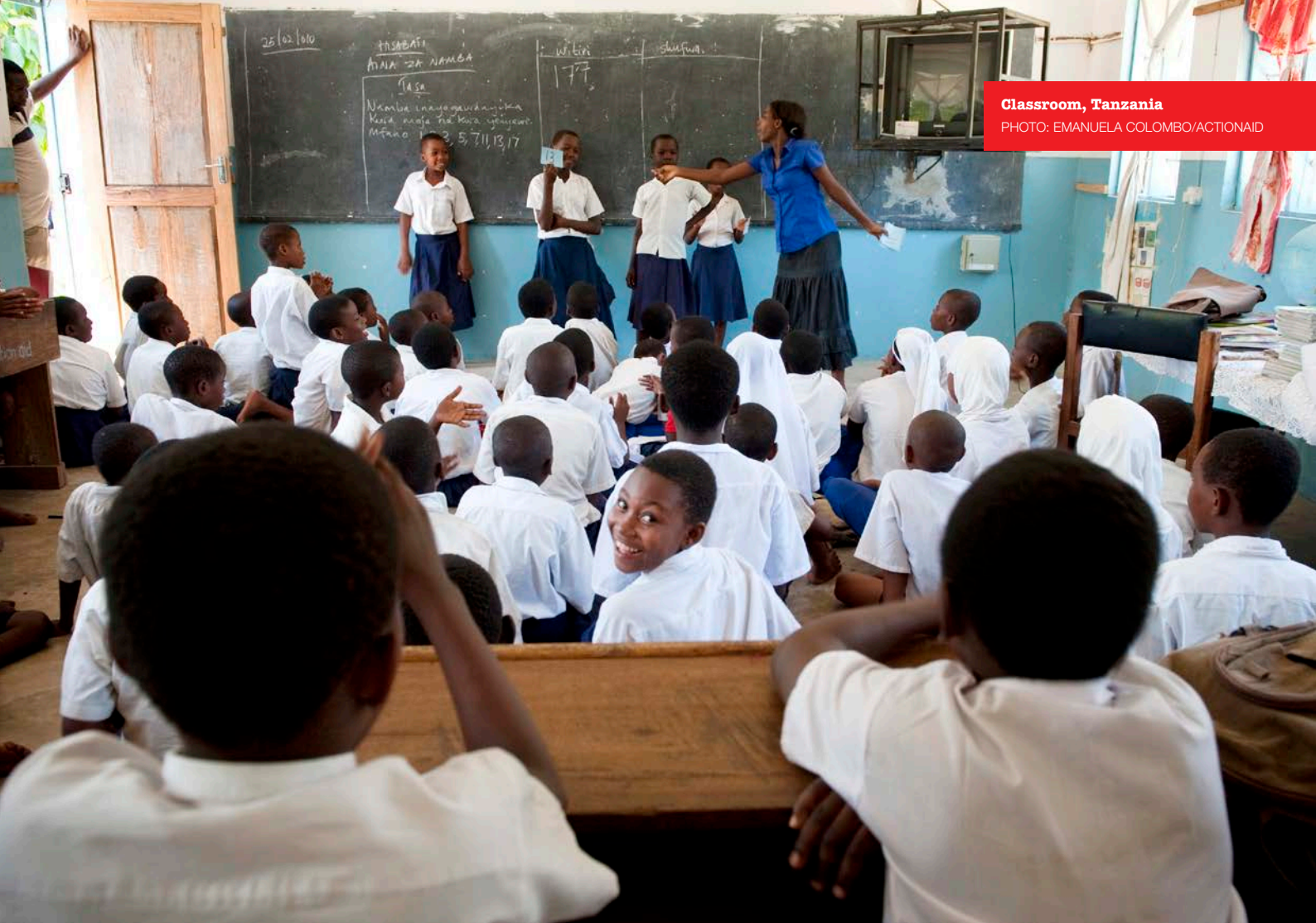
Classroom, Tanzania