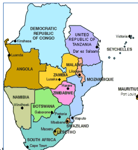
Fig1: Map of SADC countries