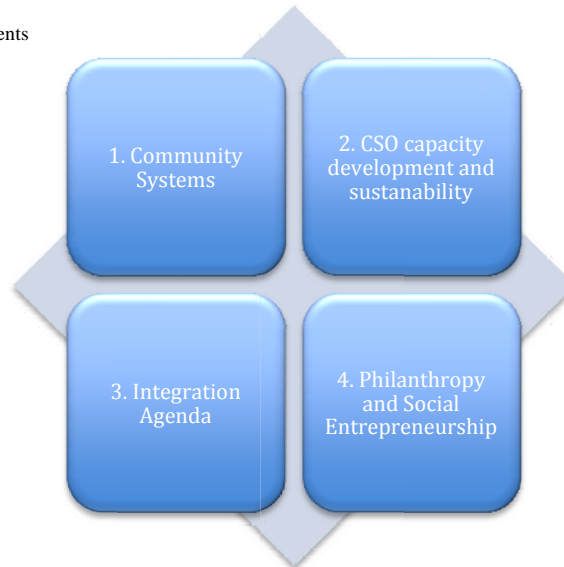
Fig 2: core elements

Each of the core elements will be discussed in turn, supported by suggested Service Delivery Areas (SDAs) 5 , examples of activities and sample indicators. This guide was designed primarily to inform programming at country level and/or finalisation of GF country proposals. Organisations or country representatives are encouraged to extract what is appropriate and useful for their contexts and purposes. It is the hope that the SDAs, activities and indicators will grow as a dynamic resource for all as lessons learned and good practices are drawn out from CSS experiences. The SDAs below are numbered for ease of reference and should not be read in any particular order.