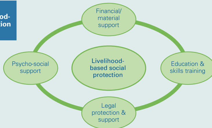
Figure 2: Elements of livelihood-based social protection

All SADC member states have specific policies targeting OVC. However, programmes remain focused on children's immediate material needs and lack more sustainable livelihood and rights-based approaches. The latter kind of approaches take into account not only the immediate needs of OVC but also their long-term physical, emotional, legal and economic needs, and treat these as basic rights. With the shift from provision of social transfers such as food and monetary aid to more comprehensive social protection characterized by the provision, protection and promotion of livelihoods, it is necessary for southern African states to make a corresponding shift in policy.