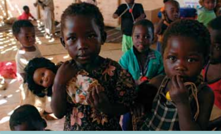
Children play at the UNICEF-supported Consol Homes Orphan Care Centre in Malawi. The community-based centre supports orphaned and other vulnerable children, many of whom are affected by HIV/AIDS.