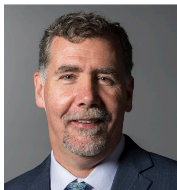
Immediate Past President

University of the West Indies University Hospital of the West Indies Department of Pediatrics