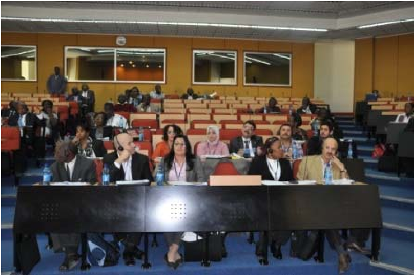
The CSO Forum Management Committee welcomes participants from North Africa and counts on their continued participation at future meetings.