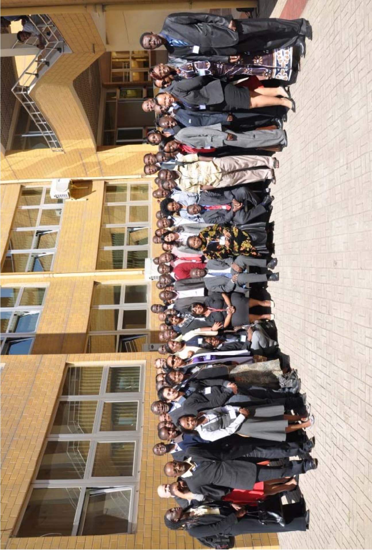
Fifth CSO Forum Participants, November 22 – 24, 2011, Addis Ababa